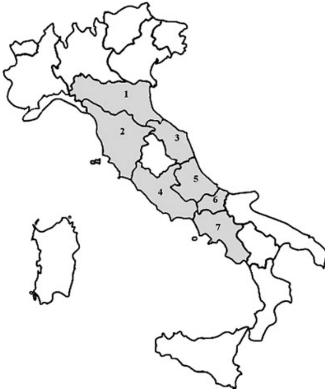
Fig. 1. Italian regions from which the skeletal samples for this study derive. 1 = Emilia Romagna, 2 = Tuscany, 3 = Marche, 4 = Latium, 5 = Abruzzo, 6 = Molise, 7 = Campania.

calculates the average of the difference in stature values obtained from single bones for each individual. Regression formulae with the lowest values of delta are those that were calibrated on human samples with limb proportions most similar with the limb proportions of the sample under study and thus, at least from this point of view, the most reliable.